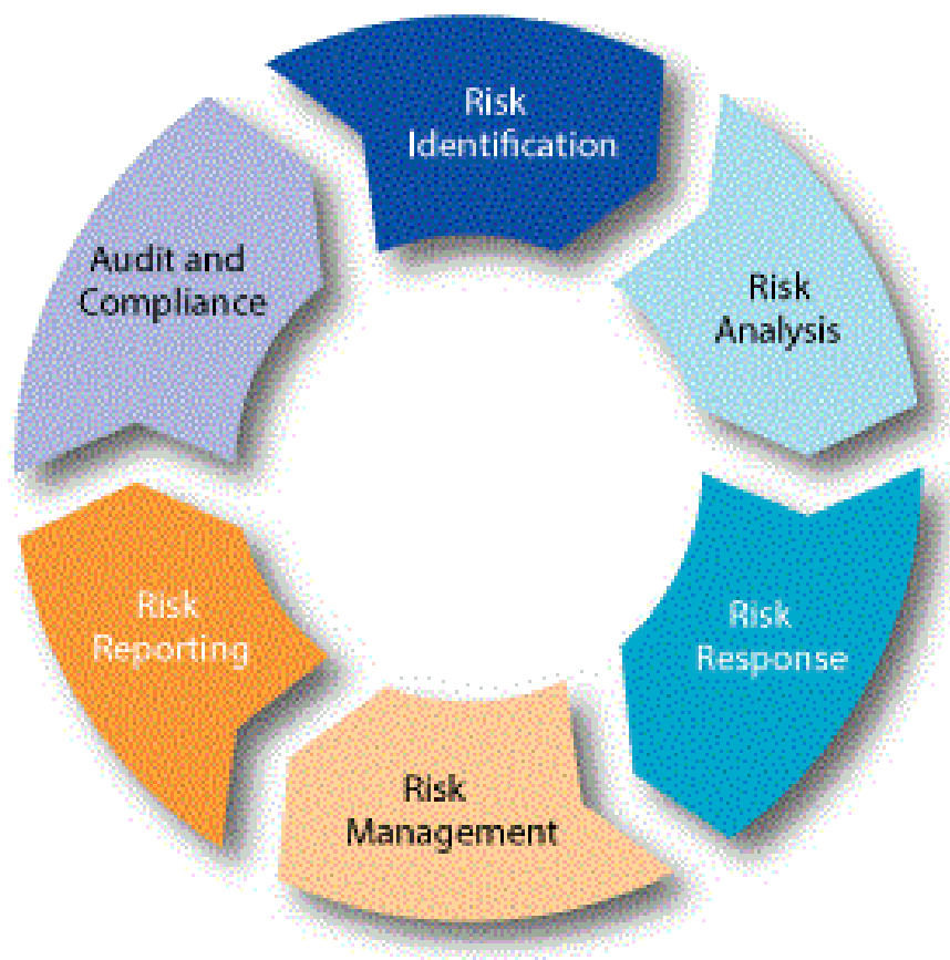
Fig. 2 The scheme of risk management

military insurance an unknown quantity for insurance companies with a high risk that a military insurance policy could lead to insolvency.